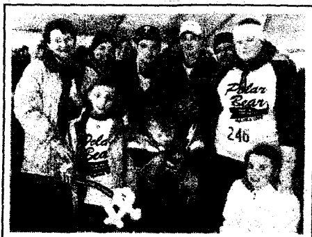
Members of the Schad family group